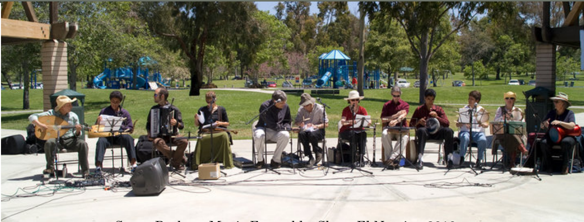
Santa Barbara Music Ensemble, Sham El Nessim, 2010